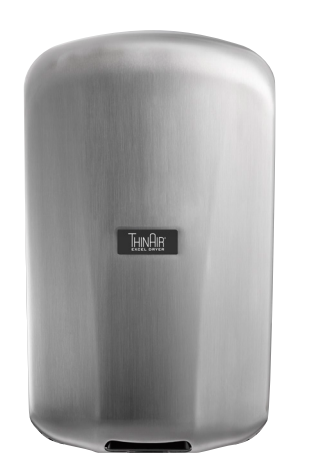
TA-SB Brushed Stainless Steel